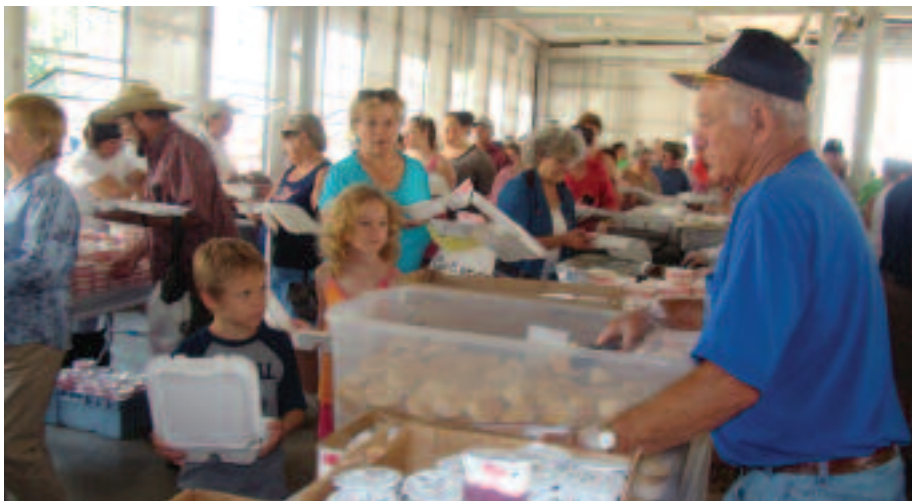
LUNCH LINE SELECTIONS: Folks of all ages fairly flew through the lunch lines until they got stalled making a choice.